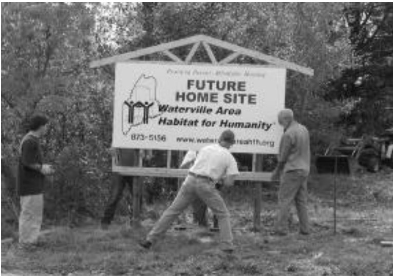
The WAHFH sign goes back up!